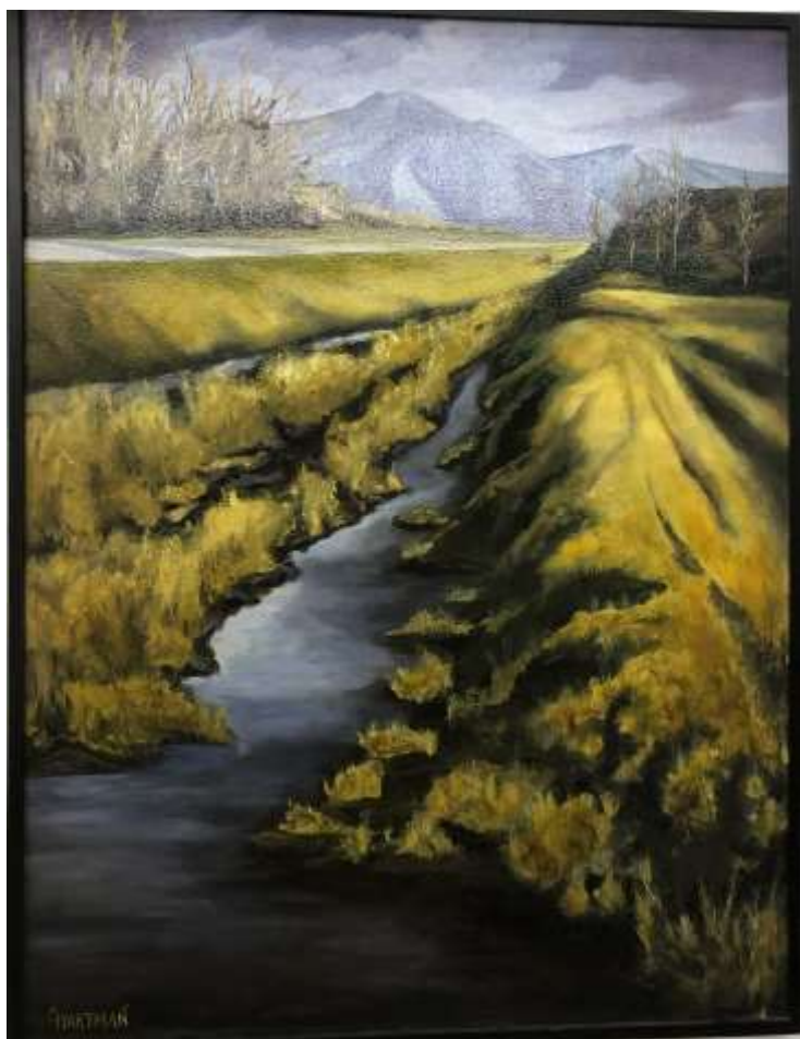
"Signs of Spring"